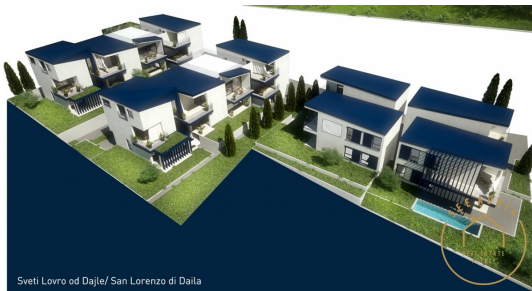
Sveti Lovro od Dajle/ San Lorenzo di Daila